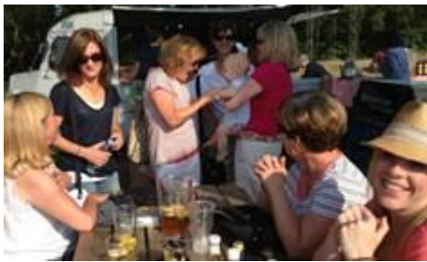
Drinks At The Serpentine!

What a glorious summer it has been! Day after day of bright sunshine, blue sky, light breezes and warm temperatures; one could be forgiven for forgetting they are in Blighty. The days are waning a bit, but light still lingers well into the evening and there is much to be enjoyed as summer gives way to Autumn's golden glow and cool evenings.