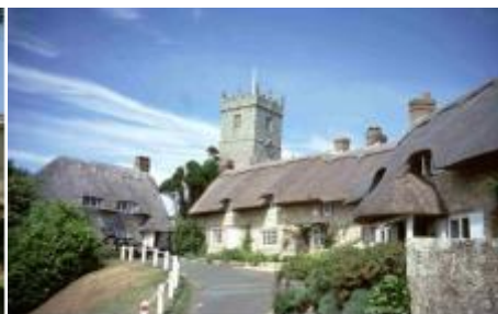
Thatched village of Godshill